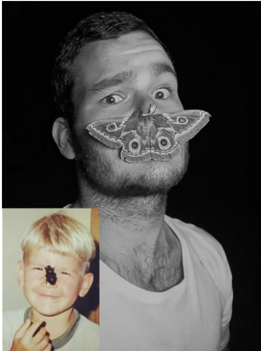
Me at the age of four with a female rhino beetle ( Oryctes boas ) and at 24 with a female zig-zag emperor moth ( Gonimbrasia tyrrhea ).

I don't know where my passion for insects came from. It was just there, since I can remember! And it's really challenging to prioritize and focus on "more important" things with such an intense passion lurking in your subconscious. I grew up in Kraaifontein, a suburb of Cape Town in the Western Cape. I never had a dull moment, because we are surrounded with insects and other arthropods regardless of where we are. I've spent every break (yes, every single one!) at school searching for insects and other interesting arthropods. I couldn't wait to finish my lunch so that I can use my lunch box for catching insects. In class, all I could think of is where to explore next in my next break or after school. On my way home from school, I would sneak into peoples' gardens with the hope to find something new or different. The more places I could explore, the better! Needless to say- I've been chased away so many times! Can you imagine a random small kid flipping rocks and logs in your garden? By that time, I knew exactly which insects I can find in our backyard, what they're eating and where to find them. I am very grateful that my parents always encouraged me to learn more about my passion by buying me books. At the age of nine, we moved to a smallholding near Klawer (between Clanwilliam and Vredendal). I spent the rest of my school career in a hostel in Clanwilliam. I went to an agricultural school where having a girlfriend and playing